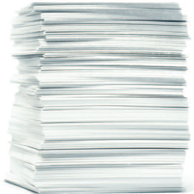
THE NEXT-BEST SYSTEM

(and up to 50x more efficient than other approaches)